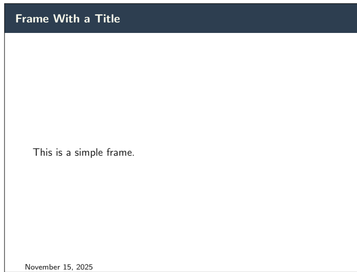
Figure 1: A simple example.

For best results, we recommend installing the fonts Fira Sans and Fira Mono and compiling with Gotham using XeLaTeX or LuaTeX. These are optional dependencies; Gotham is compatible with (e.g.) pdfL A T E X and will fall back to standard fonts if Fira Sans or Fira Mono is not installed.